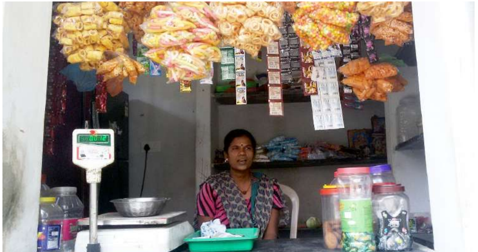
Loan ID- TRCK@2900