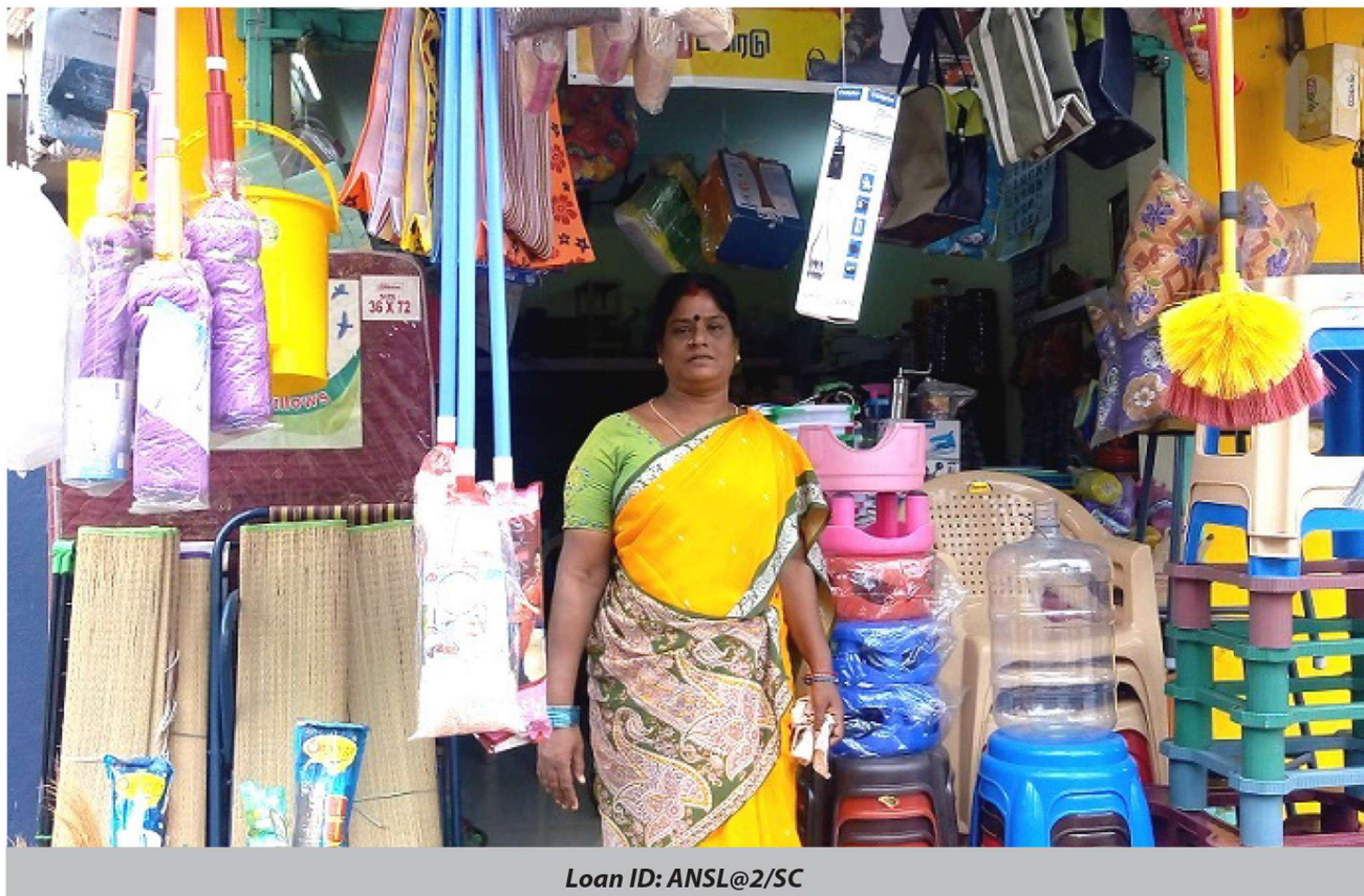
Loan ID: ANSL@2/SC