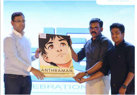
Launch of 'Anthraman', a comic series on financial literacy for children

Muthoot Microfin has won the overall championship at 'Blue Waves' – annual event conducted competitively among Muthoot Pappachan Group of companies – held at the Mar Ivanios College Auditorium on 8th February.