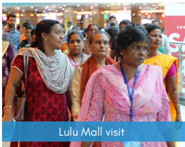
Lulu Mall visit