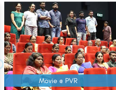
Movie @ PVR