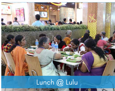
Lunch @ Lulu